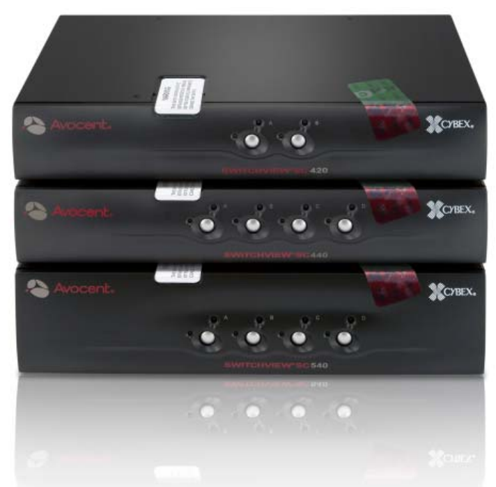
SwitchView SC420, SC440 and SC540 switching solutions provide three layers of tamper-proof hardware security and CAC support at the desktop

The SwitchView SC420, SC440 and SC540 switches allow desktop IT administrators to deploy a single CAC reader that will switch to all computers connected to the switch. (CAC support is required for all government employees attempting to log in to government systems and is specified in the Homeland Security Presidential Directive 12 [HSPD12].) Both switches include three layers of tamper-proof hardware security at the desktop. In addition, SwitchView SC420, SC440 and SC540 switches ensure that only USB human interface devices (HID's) function on target computers by constantly monitoring all devices attached to the console ports. These switches ignore communication from non-HID's (such as flash drives, hard disk drives, cameras and printers) when switching data to the target.